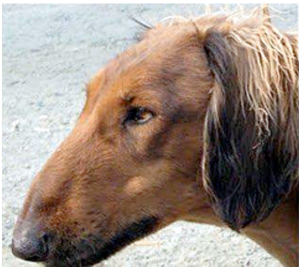
Head of a red sable

We forgathered the next cold but sunny morning in the metalworking yard. About 15 Xigou with about 20 hunters piled into an assortment of vehicles and we set off in convoy. I had expected we would head into the deep countryside but we stopped after about 20 minutes still in sight of the massive smoke stacks of the town's power station. The land all around was flat and cultivated with alternate strips of cotton bushes and sprouting winter wheat. A river meandered through the fields and provided some rough cover along its banks. The hunters broke up into small groups to walk up the field, just as we would do with Salukis elsewhere, and began beating out one of the cotton strips. The hounds were held on simple rope slips, with one end tied to the wrist and the other