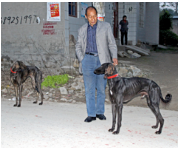
Black/chocolate male and dark brindle sibling

But I was keen to see these hounds in their more natural environment in the countryside, so my Chinese guide and mentor took me east from Xi'an on a circuitous journey to the Hua Mountains. On the way we called at the houses of two breeders and saw some hunting Xigou . These hounds did not at first sight appear particularly big but when I measured them they too were all in the range of 70-72 cm