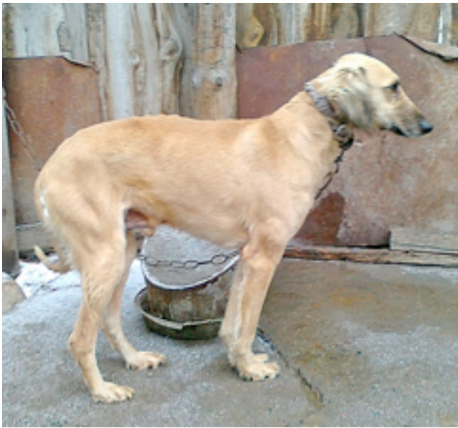
Tazy male of choban Yasha, chained on the yard; Zhetygen village

At present, in Almaty Province, the type of a dog food determines the conditions for keeping Tazys. Three basic types can be distinguished: "free foods", "budgetary" and "meat-bone" feeding. Each of these types has its own benefits and disadvantages. It is possible to say that there are no strict rules to follow in these types of feeding regimes.