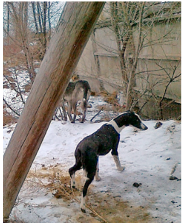
Tazy of choban Yasha on the village wasteland

Because collective ethnic wisdom accepts the superiority of "adequate civilization", the sacrifice of the Tazy does not evoke sympathy in response to a universal cry about it as a national catastrophe, because life dictates other priorities. In the future, the place of the breed in the context of the traditional criteria of its preservation will worsen as a result of the reduction of hunting grounds, population increase, regional and international development, expansion into new territories, railroads, pipe lines etc.