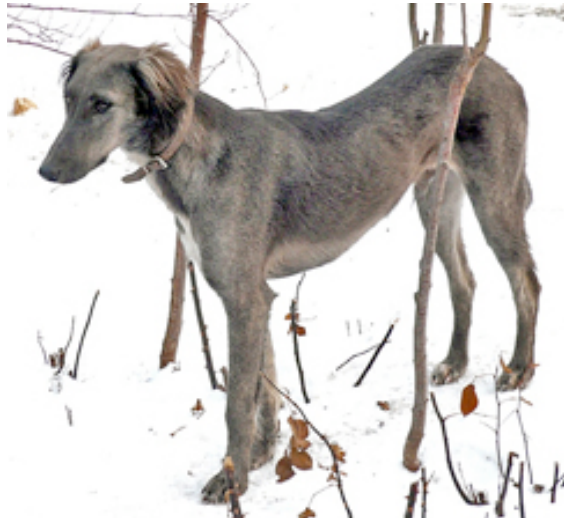
Amigo inside yard surrounded with a solid fencing. Uzynagash village

is supplemented with vitamins, but more often not, because vitamins are listed in the dry dog food labels. Tazys kept by hunters, despite being fed with dry dog food and despite their smallish stature and their small numbers, catch foxes successfully.