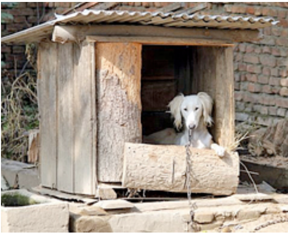
White dog in a kennel