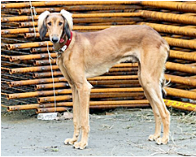
Red sable dog