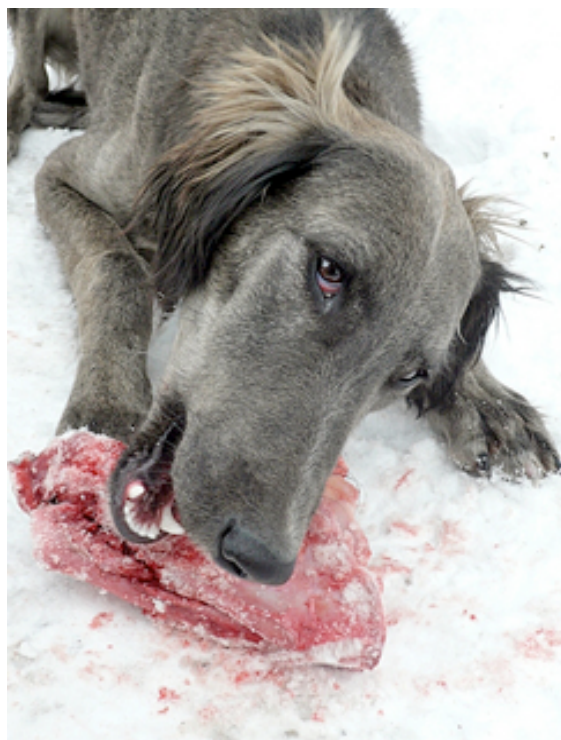
Amigo; Meat and bona diet. Feeding with raw beef palate

Except for those Tazys which live in city apartments and kennels with their pens made of wire, this breed is incompatible with