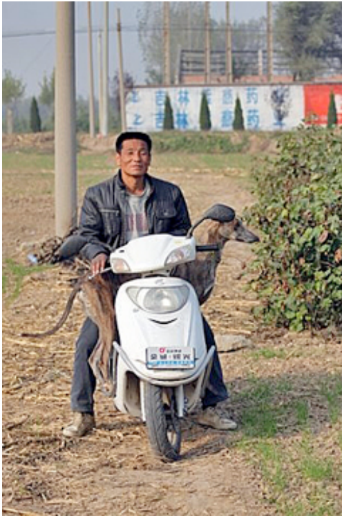
Hunter with Greyhound on a motor scooter

the pack if the hare is pulled down nearby. At the end of these hunts I saw how the hunters returned with the bag suspended from poles looking remarkably undamaged. The hare is similar to our European brown hare, though somewhat smaller, weighing typically up to 2 kg.