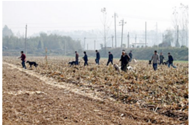
Walking up the field

held in the hand, just as the hunters do in the northern parts of the Saluki's COO.