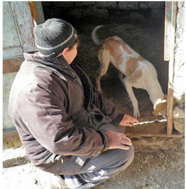
Tazy of Unatbek hunting a rat. Yzynagash village

When feeding a “meat-and-bone” diet, it is considered necessary to take the Tazy to wide open places for a long exercising run after a horse or a car over 20-30 km distance.