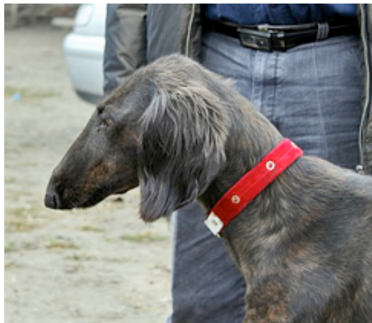
Dark brindle with a Borzoi nose