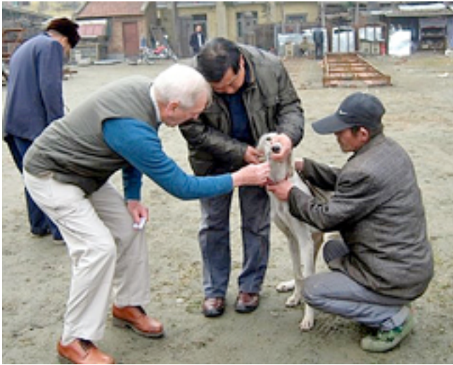
The author taking a DNA sample

I took a lot of DNA samples for laboratories in Sweden and the USA and it will be interesting to see whether the analysis shows that there is indeed a relationship between these hounds and Salukis and other similar hounds in Western and Central Asia. On their purely physical appearance, this would seem perfectly possible as some Xigou looked identical to some COO Salukis, especially from the more northerly range, and on this evidence alone they certainly resembled the hounds in the picture in the Waters' book. In size and in colour, many of the Xigou reminded me of Kurdish Iranian hounds. Others shared some of the characteristics of the Kazakh Tazys, though their overall size was much bigger. The 'sheep's nose' of some of them is a puzzle. It may have developed through a mutation in this local population during the long periods of China's isolation from the outside world and was found attractive enough to perpetuate. I found some hunters positively preferred it, while others did not like it at all. All it is possible to say at present is that it is clear from the above-mentioned early art work, that it has been present in the breed for a long time and seems likely to continue. The hunters now take part in an annual dog show and the results there may influence the future of these hounds.