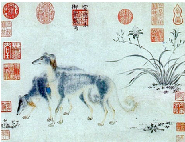
Painting from the reign of Xuan De (Ming dynasty)

century BC. Of perhaps even greater relevance to the Xigou of today, a remarkably explicit painting of a foreigner holding a hawk on his wrist while a Xigou with a distinctive 'banana-shaped' nose looks up at him is to be found as a mural in the tomb of Prince Zhanghuai, who died in 684 AD and was buried near modern Xi'an. Later paintings, such as the one used as the masthead on the Xigou web site – www.xigou.cn - from the Ming dynasty dated to 1427, show a similar hound with what contemporary Xigou breeders refer to as a 'sheep's nose'.