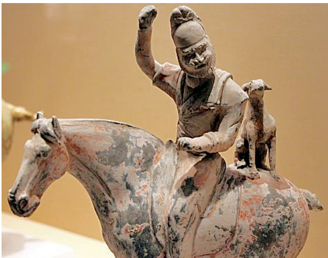
Mounted Tang hunter from 701 AD with Xigou

It was also clear from the videos taken over the last 15 years or so that, as elsewhere, times are changing. In the earlier years the hunters would pool their resources