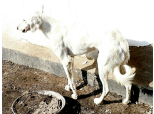
Tazy male of Kuansh

At the present time not many people in Kazakhstan can afford to make a living by hunting. If someone is hunting, this is rather a hobby than an essential necessity. This is even truer of hunting with Eastern Hounds of the Kazakh type.