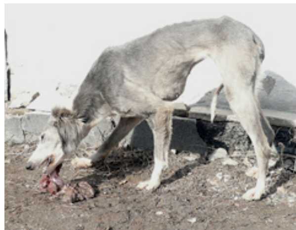
Tazy female of Kuansh eating meat of butchered limping donkey

For keeping Tazys, it is true that in modern conditions caused by socio-economical factors it is sufficient to have a large securely fenced plot supplemented with regular exercise and hunting trips in habitats least modified by human activities.