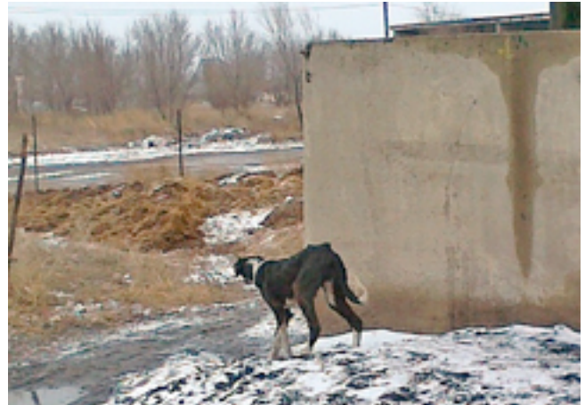
Tazy of choban Yasha heading to the village waste land to finish eating lamb entrails. Zhetygen village

Owners of Tazys, who keep them on a "free foods" regime, live in rural places and feed their dogs irregularly; the dogs have freedom to run in the steppes, mountain hills and river valleys and to hunt to supplement the meager food given to them at home, which consist mainly of table scraps and the skins and entrails of butchered animals. Periodically the Tazy is given a broth made of bones with barley and bread soaked in it.