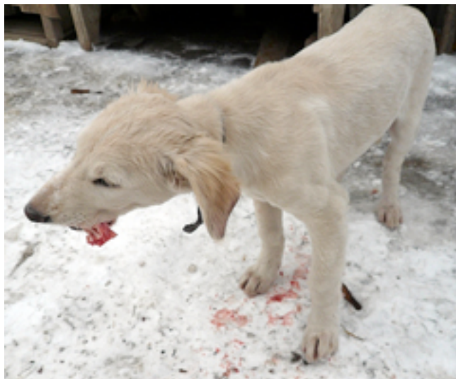
Chiquita. Meat and bone diet, eating raw cow palate

average price of a capable hunting Tazy found on the market and in advertisements. Interest in the breed, which is heated up by programs of trendy quasi-national movements, encourages advertisements for puppies at prices up to $500-$800 ($1=T145). Naturally, such advertisements are targeting at breeders and traders from Russia, Ukraine, the Baltic countries and the countries of Eastern Europe and beyond. This is how Tazy trafficking is taking shape. This topic will be discussed in following articles.