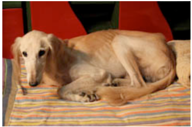
Xigou in Xi'an

Xi'an today is a big, bustling modern city of some eight million people but traces of its glorious past are to be found at its centre in its massive old city walls 24 km long, its Grand Mosque founded in 742 with its beautiful Arabic calligraphy and several towering pagodas from the 14 th century. However most impressive of all is the 'Eighth Wonder of the World', the terracotta warriors and horses of the Qin dynasty's first emperor – Shi Huangdi – from c. 204 AD, located at a site a short drive east of the city. Xi'an did not seem the place for seeing hunting hounds but I was wrong!