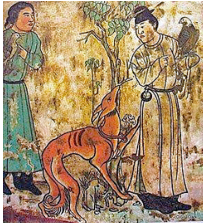
Mural from the tomb of Prince Zhanghuai (d. 684 AD)]

greater or lesser ease, depending on who was in control over the land mass through which the routes passed. Trade along the Silk Road reached its peak in the 7 th century under the Tang dynasty, with their capital in Chang'an, when China was the richest and most powerful country in the world and Persians, Arabs, Uighurs and Jews flocked in with their different languages, customs and religions to create a most cosmopolitan society. The first Arabs are recorded as having reached Chang'an in 651 AD but Islam made its major impact on the area a hundred years later, when Muslim Arabs defeated the Tang army at the Talas River (now in Kazakhstan). The Arabs at that time were prodigious hunters with both hawk and hound and it is probable that they brought their Salukis with them, most likely of the feathered variety from Khorasan in northern Iran which they had already conquered.