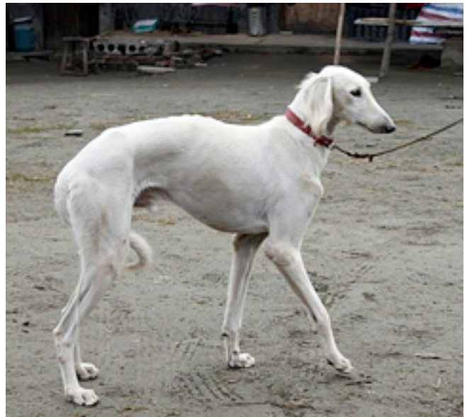
White dog with a standard nose

The first hound brought out for my inspection was really striking: a year-old male, he was big, measuring 80 cm at the shoulder, and he was a black-masked red sable with honey-coloured burki ; but it was the shape of his head that was most remarkable – a most pronounced sheep's nose. He was followed by a series of hounds showing the range of head shapes and colours from brindle to white to black. The one I related to most as it was so Saluki-like was another red sable (#12). Some of the hounds were very broad in the chest when seen from the front, which made their front legs seem bandy (#13), and a few had a somewhat roached back (#14). Most of the hounds had purely descriptive names such as Bailong = White Dragon or Xiezi = Scorpion or Heihu = Black tiger.