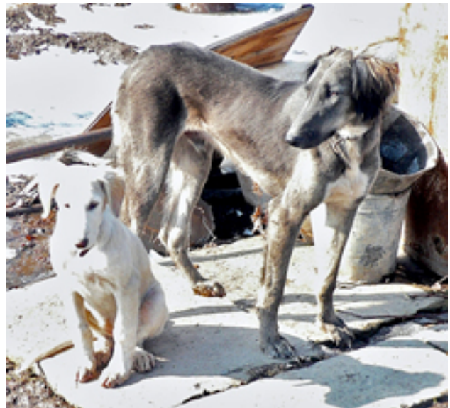
Chiquita and Amigo on the yard, Uzynagash village

Those few hunters, who can afford regular trips to hunt and keep their hounds in conditions most similar to natural surroundings, can expect that their Tazys will retain their essence and purpose which has been preprogrammed in them during past millennia.