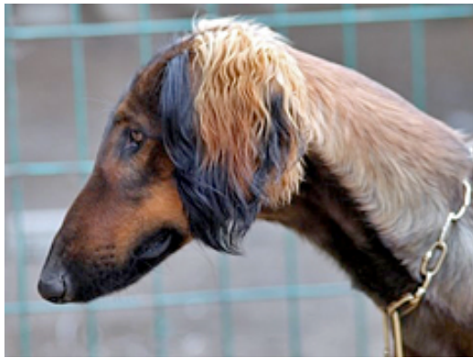
Black-masked red sable with a pronounced sheep's nose

sleeping compartment on a raised wooden floor. The hounds are hardy as they sleep here without bedding or coat even in winter. I had clearly come to the right place to see a range of these hounds.