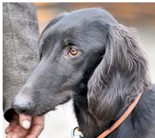
Black dog with a standard nose